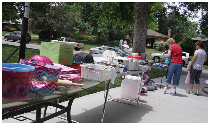
Annual Yard Sale - June 7-8