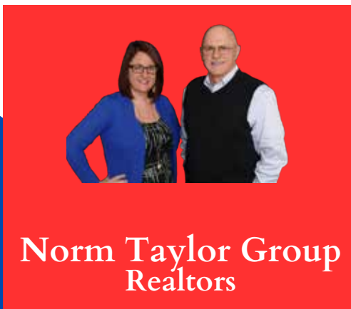
Norm Taylor Group Realtors

Contact us today for your no obligation Market Analysis of your property.