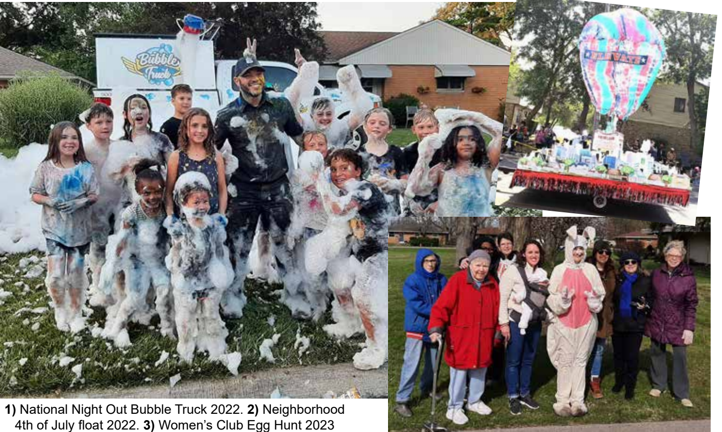
1) National Night Out Bubble Truck 2022. 2) Neighborhood 4th of July float 2022. 3) Women's Club Egg Hunt 2023

Reaching over 730 homes in the communities of Maize Meadows, Baby Farms and Moores and Dales